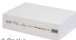
PB414 White Card Packs