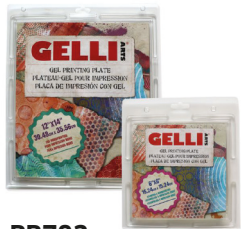
PR702 Gelli Printing Plates