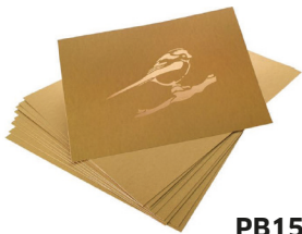
PB155 Stencil Card