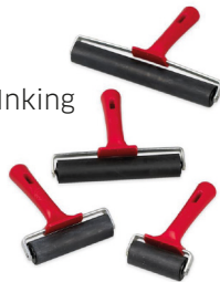
PR127S Set of 4 Inking Rollers