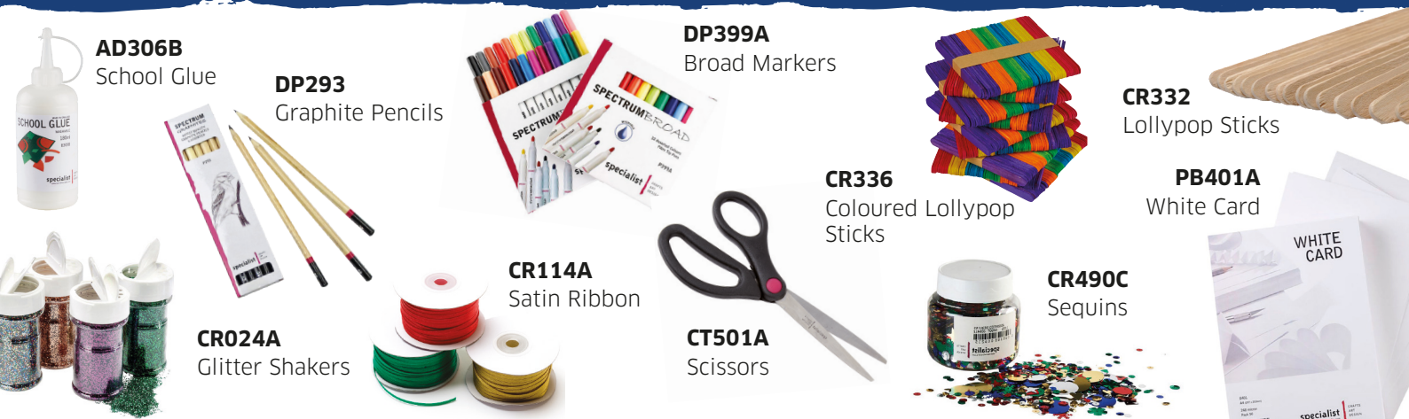
AD306B School Glue