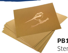
PB155 Stencil Card