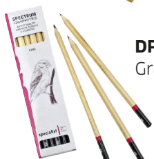
DP293 Graphite Pencils