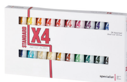
PD367C X4 Acryl Tube Set