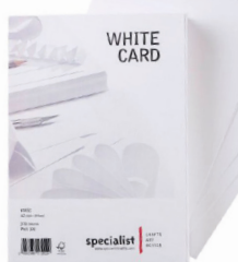
PB403 White Card