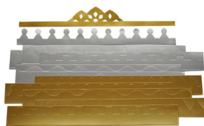
CR695 Card Crowns