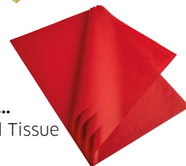
PB009A... Coloured Tissue Paper