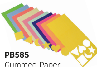
PB585 Gummed Paper Shapes