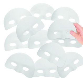
CR262 Half Face Masks