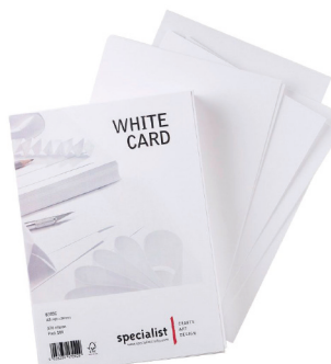
PB403 Thick White Card