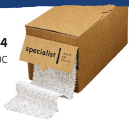
PM024 Mod Roc