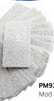
PM923 Mod Roc Strips