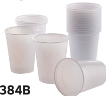
PD384B Readymixed Into Pack