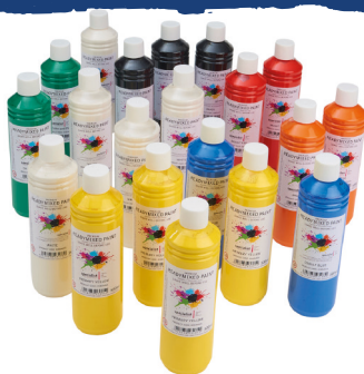
PD384B Readymixed Into Pack