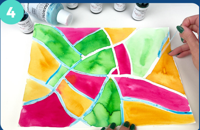
Once the inks are dry, you can peel off the drawing gum to reveal the masked-off areas below, revealing your final background design.