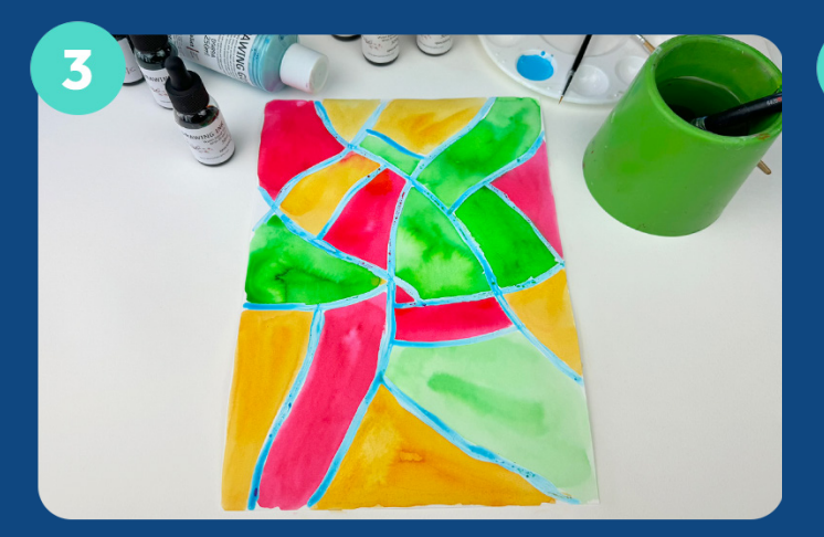
Apply the drawing ink using a colourful layout. You can experiment with softer shades by watering down the inks.