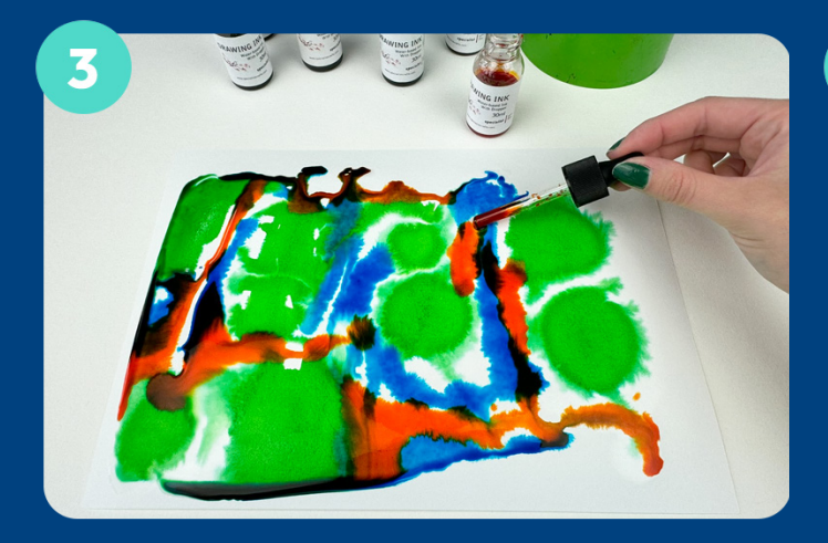
Whilst the water is still wet, apply a variety of inks using the dropper tool on top. Watch as the inks bleed into each other and fill the page! Use a brush if some of the inks don't spread as much.