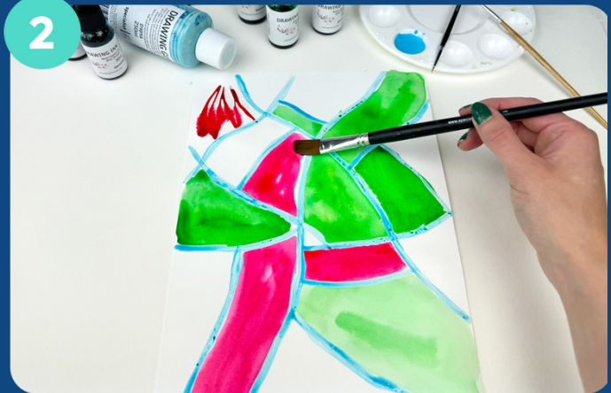
Allow the drawing gum to dry. Next, wet the paper in between these areas. Using a dropper tool, apply drawing ink to your design and spread it using a brush.