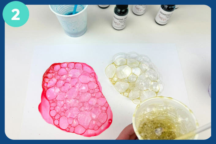
Once stirred, gently blow into the liquid using a straw to create a crown of bubbles extending the cup's height. Keep blowing until you can tilt the bubbles onto a sheet of cartridge paper.