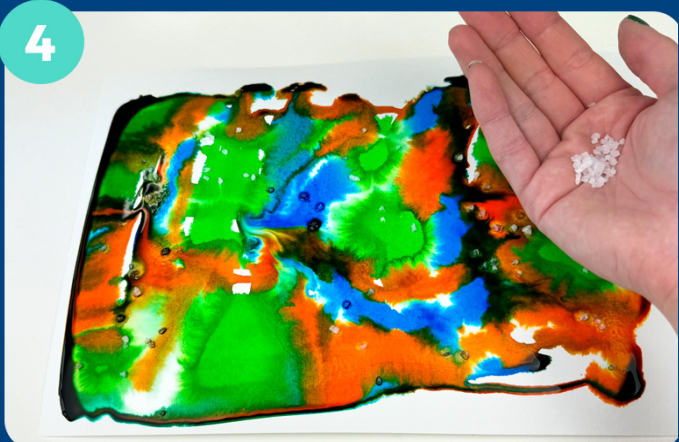
On top of the wet ink, take a handful of batik salt and drop it on top of the ink. You will start to see the salt absorbing the water, pulling the ink into a star-like shape with textured edges. Allow to dry; then, the salt can be flaked off to reveal your background design.