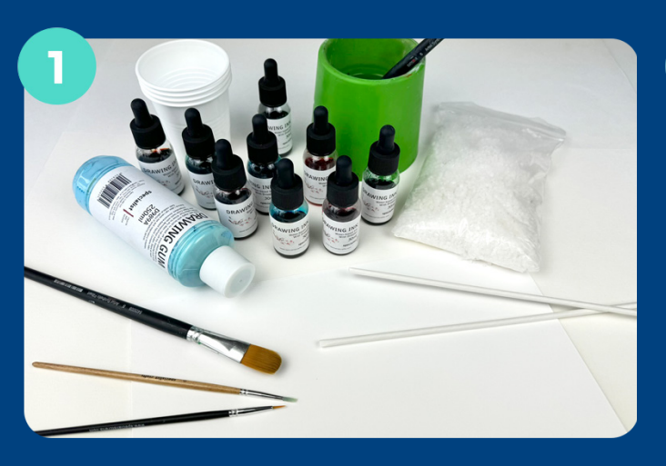
Prepare your workspace. These techniques will need a range of drawing inks with a dropper tool, plastic cups, a selection of brushes, batik or silk salt, a water pot, drawing gum, straws, washing up liquid, and cartridge paper.