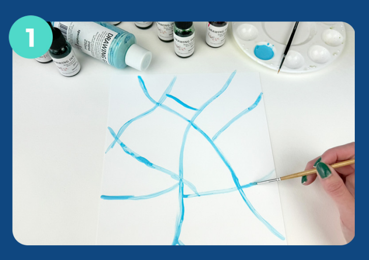
Begin by painting on drawing gum to a sheet of cartridge paper using a brush in your chosen design. This will create masked-off areas to remain free from water-based colour.