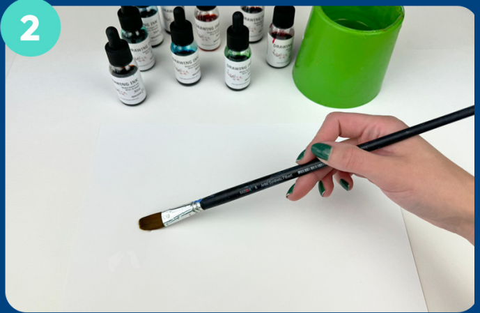
Start by applying a generous layer of water to a sheet of cartridge paper.